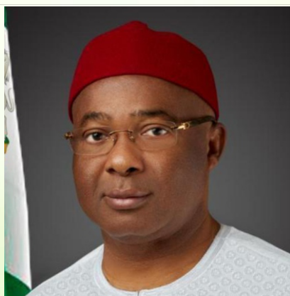
HIS EXCELLENCY HOPE UZODIMMA GOVERNOR OF IMO STATE