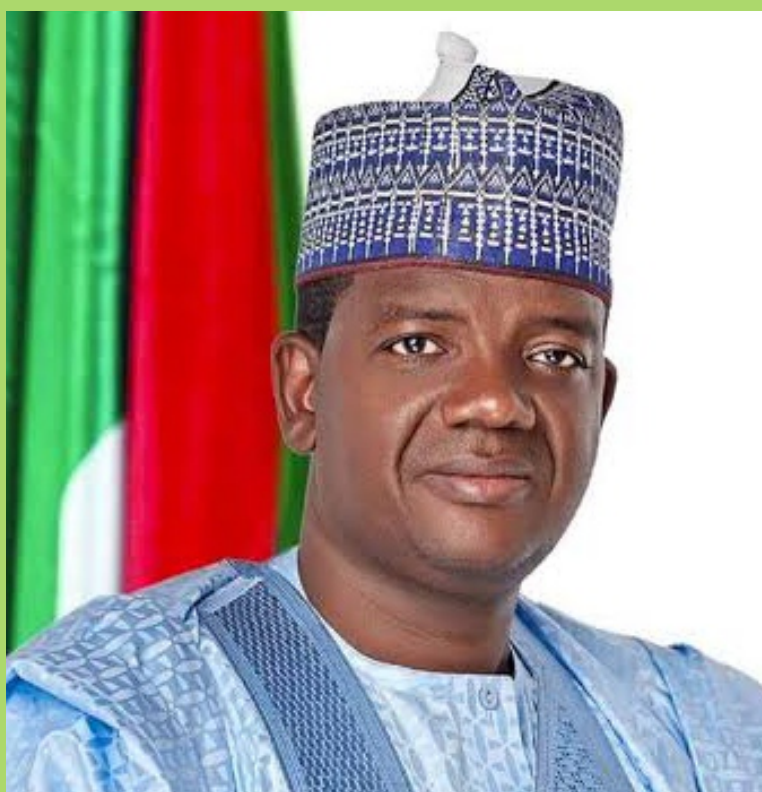
HIS EXCELLENCY DR. BELLO MOHAMMED MATAWALLE MON HONOURABLE MINISTER OF STATE FOR DEFENCE FEDERAL REPUBLIC OF NIGERIA