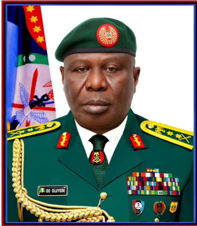
GEN OO OLUYEDE AFM NAM CMH GSS psc mni FCM FCMH TSM GOM CCA CHIEF OF DEFENCE STAFF ARMED FORCES OF NIGERIA