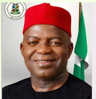
HIS EXCELLENCY DR. ALEX OTTI GOVERNOR OF ABIA STATE