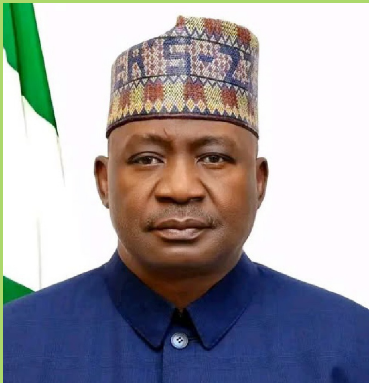
GENERAL CHRISTOPHER GWABIN MUSA (RTD) HONOURABLE MINISTER OF DEFENCE FEDERAL REPUBLIC OF NIGERIA