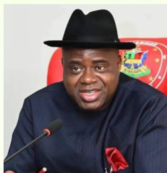
HIS EXCELLENCY DOUYE DIRI GOVERNOR OF BAYELSA STATE