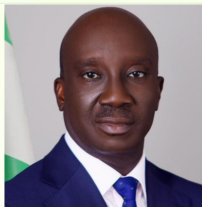
HIS EXCELLENCY OKPEBHOLO PROMISES GOVERNOR OF EDO STATE