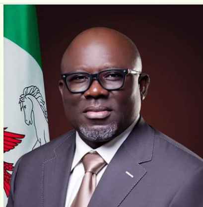
HIS EXCELLENCY RT. HON. ELDER SHERIF F.O. OBOREVWORI GOVERNOR OF DELTA STATE